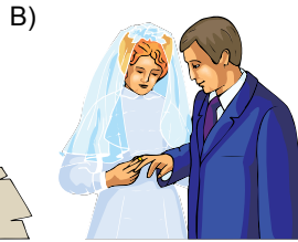
FANCY DRESS PARTY